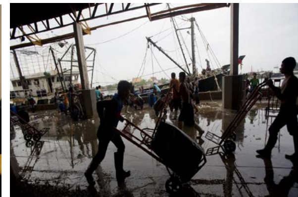
Fishing and food processing